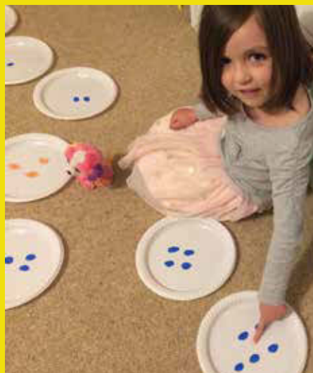
Figure 3. A child explains why one plate has more dots than another.

For example, a child might reason that a 5-dot plate has more dots than a 4-dot plate because ‘they both have 4 (gesturing towards the 4-dot pattern as it appears on a dice), but this plate has 1 more’ (see Figure 3).