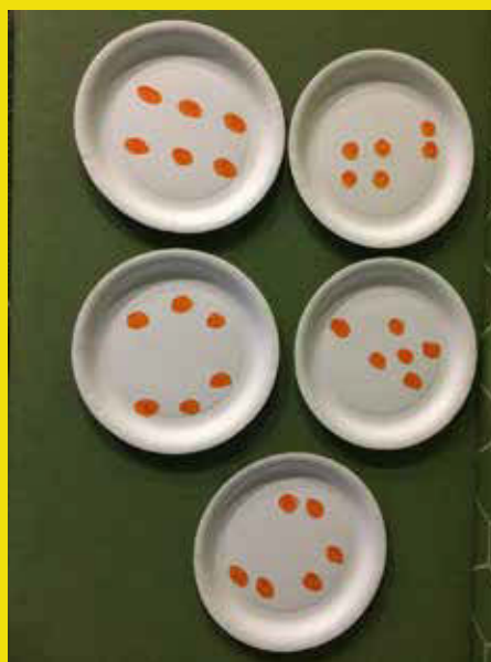
Figure 1. Some different ways of representing the number 6.

One way of encouraging the development of subitising is to create a set of paper plates with different dot combinations as a classroom resource. I would suggest creating a set of 50 paper plates, with each number between 1 and 10 being represented in multiple ways. For example, the number 6 might be represented as two groups of 3 (i.e., the dice image), as three groups of 2, as 4 and 2 more, as 5 and 1 more, or as a semi-circle (see Figure 1).